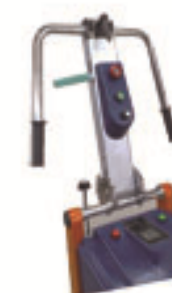
Handle can be turned around 360 degree