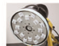
Disc plate equips 8 or 16 pieces of diamond tools.