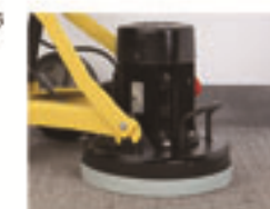
Vacuum port and the skirt prevent dust from outside.