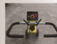
Handle, can be adjusted to different degree.