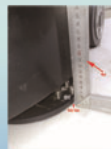
Distance toward Wall only 5mm.