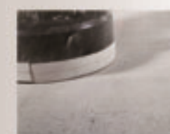
Skirt stick to machine by nylon.