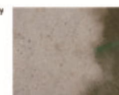
Grinded floor compared to ungrinded.