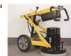
Machine can be folded.