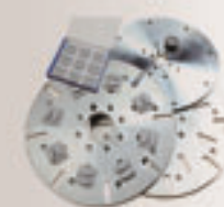
Disc plate of HWG-400.