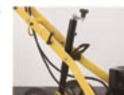
Handle bar adjust height of handle.